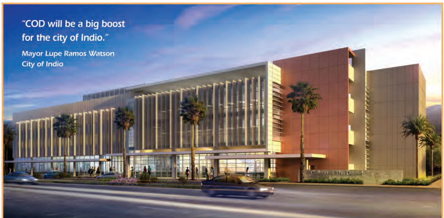
Design concept of the East Valley Campus-Indio.

Construction is expected to start in 2012, and the campus is slated to open in 2013.