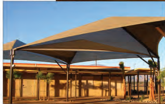
The East Valley Campus- Mecca/Thermal opened in 2009

Programs offered at the campus are Adult Basic Education, English as a Second Language, a selection of college credit courses, and general interest courses. The campus started with a student enrollment of 246 and, to date, enrollment has increased to 499.